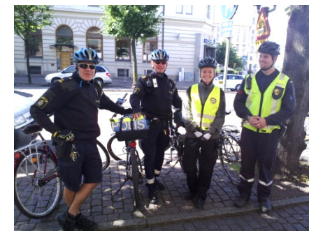
Operational collaboration unit for local traffic regulations (Done)