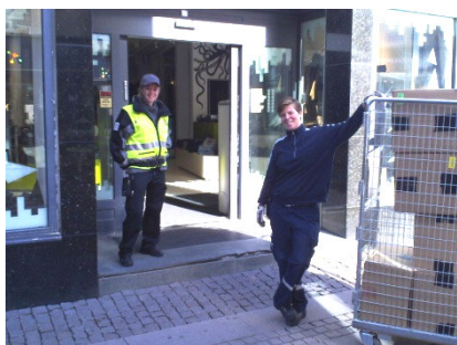
Early morning distribution with a concept by guards (in progress)