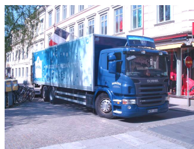
Length regulations, maximum 10m. (done)