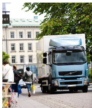
High level of authorized vehicles within the local environment zone (done)