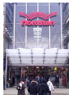
C/O concept for shopping mall (in progress)