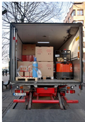
Collaboration unit "safer deliveries in city centre" (done)