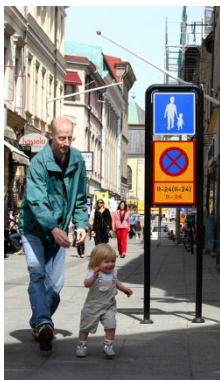
Pedestrian streets with time windows (done)

What has actually been obtained during the last 3 years by the freight Network?