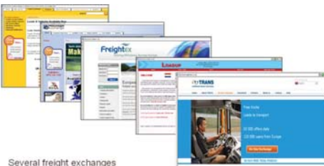
Several freight exchanges UK & mainland Europe Different charging structures – Subscription based & load fees Open/Closed schemes

Work has begun on researching the merits of individual freight exchange service providers. The research will improve understanding of the benefits to hauliers by using